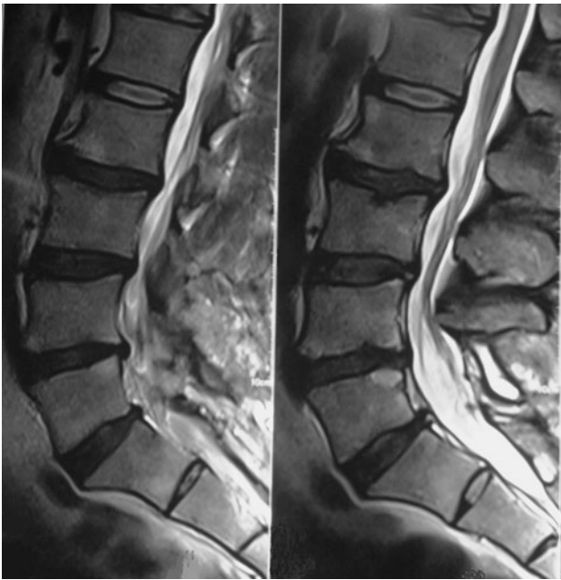
Fig. 3 Postoperative sagittal spinal MRI shows the resolution of the pseudomeningocele with small remnant cyst, but there is no pressure effect

A pseudomeningocele can be a postoperative complication of laminectomy and is the result of an incidental dural tear [16–21].